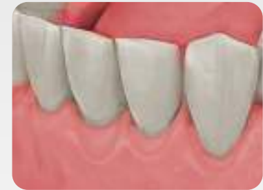
After treatment with SZ Viskos Flow LC Gum